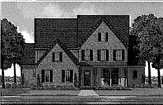
Built by Southern Serenity Homes. In Kensington Manor, Lakeland, TN. Estimated value $500,000.